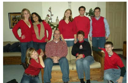
House Resident Family 2010