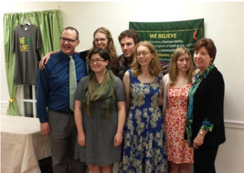
House Resident Family 2016