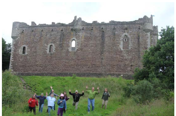
Runaway at Duone Castle

Beautiful and comfy lodgings, delicious food, deep conversations amidst much humor, and renewed ties of friendship all made the experience memorable, and a reminder that deep ties of faith and friendship formed initially at the Wesley Foundation can indeed last a lifetime – and beyond. Truly, friends are friends forever if the Lord's the Lord of them